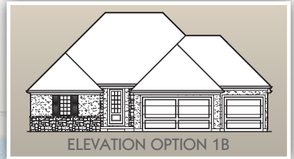
ELEVATION OPTION 1B