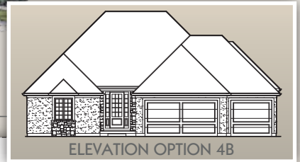
ELEVATION OPTION 4B