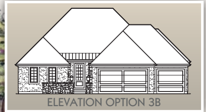
ELEVATION OPTION 3B