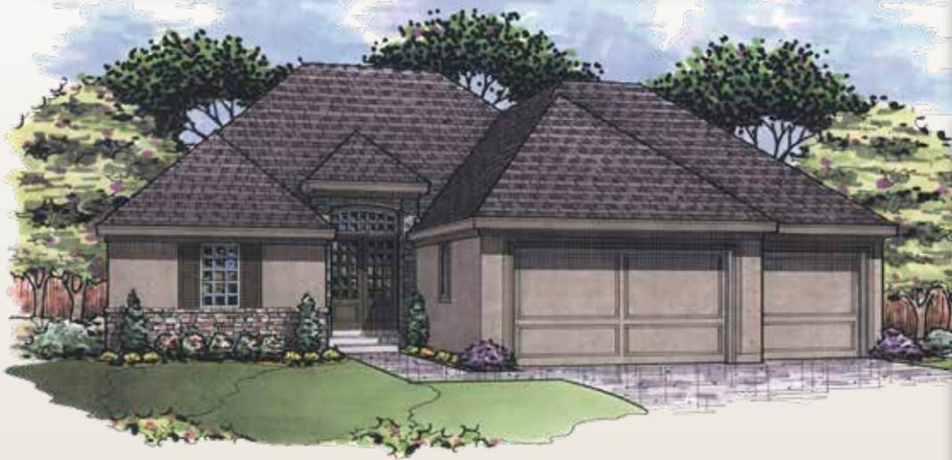
ELEVATION OPTION 2B