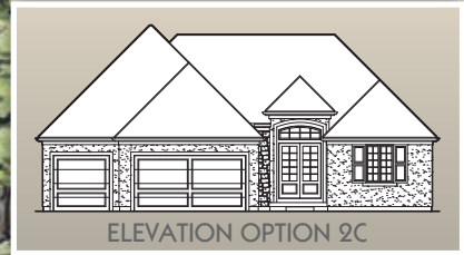
ELEVATION OPTION 2C