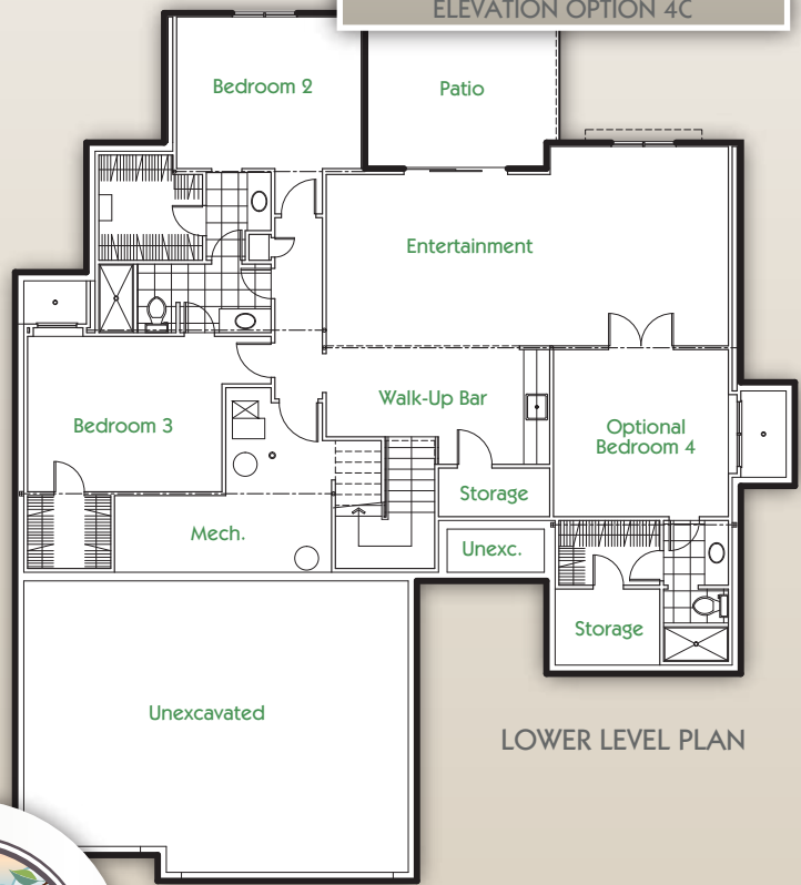
LOWER LEVEL PLAN