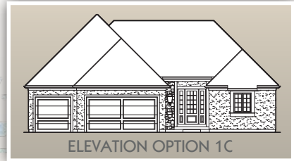
ELEVATION OPTION 1C