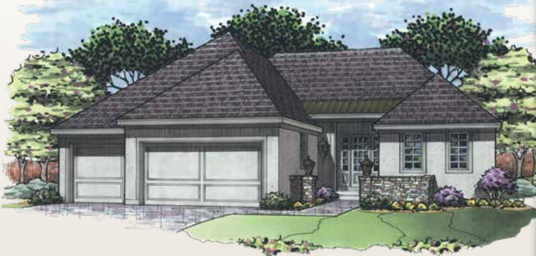
ELEVATION OPTION 3C