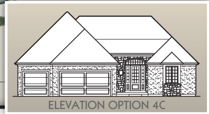
ELEVATION OPTION 4C